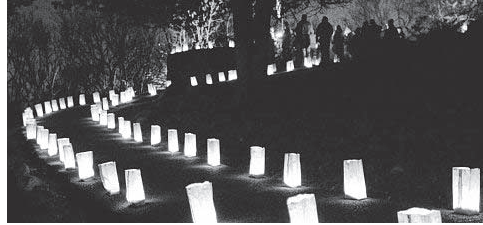
The Trail of Honor is lit by candles leading to the Vietnam Memorial at Lasdon Park in Somers.